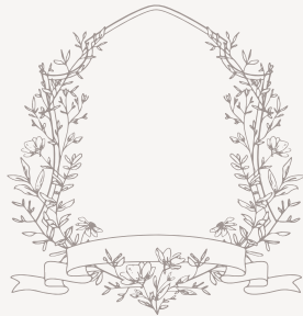
No. 2 FOLIAGE & RIBBONS

Our Floral Wreath is made up from wild flowers and untamed foliage, creating a delicate and romantic aesthetic.