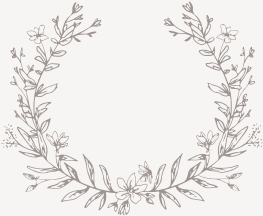
No. 1 FLORAL WREATH

EACH OF THE BELOW CRESTS CAN BE ADDED TO YOUR SUITE AS THEY ARE, HOWEVER, YOU ALSO HAVE THE OPTION OF ADDING YOUR INITIALS AND/OR YOUR SPECIAL DATE INTO THE CENTRE. EACH ONE HAS BEEN HAND ILLUSTRATED USING DELICATE BOTANICAL AND FLORAL ELEMENTS. THEY WOULD MAKE A WONDERFUL ADDITION TO ANY OF OUR SUITES.