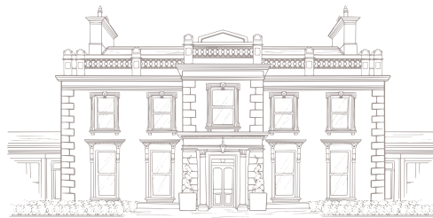
No. 2 - FORMAL LINE

Our Freehand illustrations embrace the beauty in the imperfections created when drawing with a looser but romantic style, whilst still ensuring to add all of the little details.