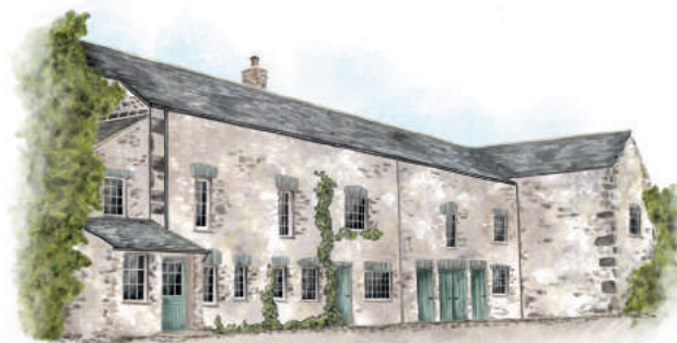
TOWN HEAD ESTATE

WE ALSO OFFER A DIGITALLY PAINTED OPTION. A WATERCOLOUR AESTHETIC WITH THE PRECISION OF A DIGITAL MEDIUM.