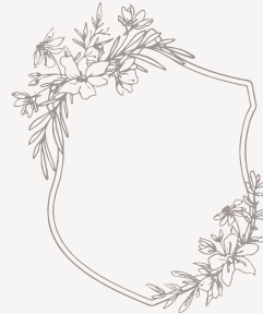
No. 3 BOTANICAL CREST

We know how important your date is, so why not include it in your crest? Our ribbon gives it the perfect placement.