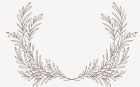
No. 4 LAUREL WREATH

Our Botanical Crest has a royal feel to it's shape. The carefully placed florals provide a delicate and fresh aesthetic.