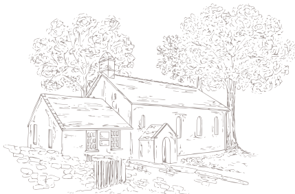
No. 1 - FREEHAND SKETCH

WE LOVE ILLUSTRATING THE BEAUTIFUL VENUES YOU CHOOSE TO SPEND YOUR SPECIAL DAY IN. WE OFFER TWO DIFFERENT STYLES FOR YOU TO CHOOSE FROM FOR OUR ILLUSTRATIONS.